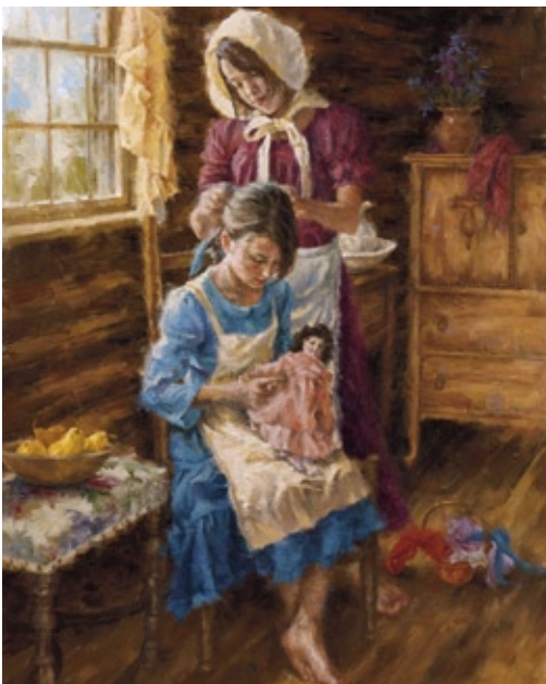
Braids, Ribbons & Bows , oil, 30 x 24"