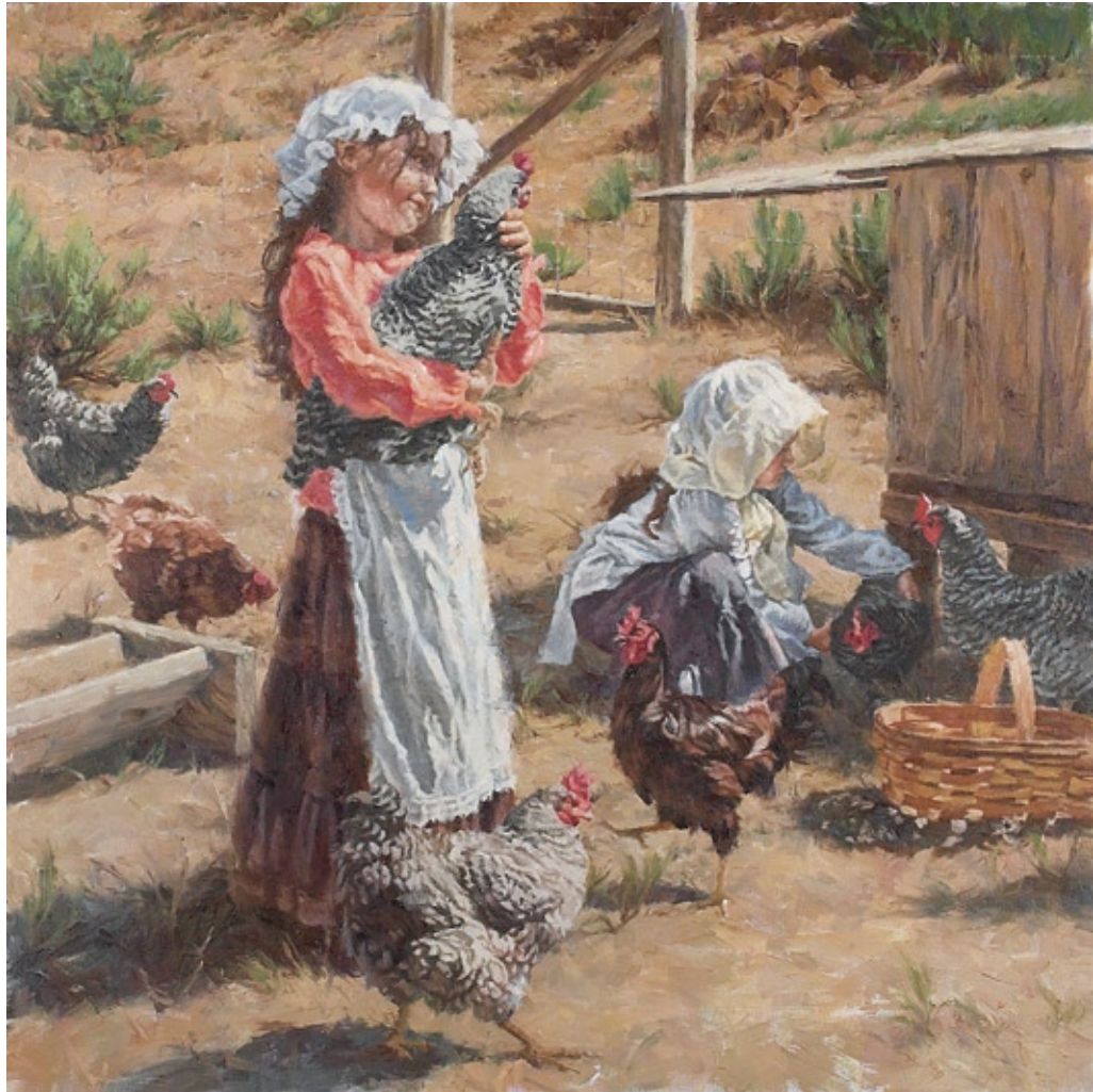
Friends of a Feather , oil, 36 x 36"