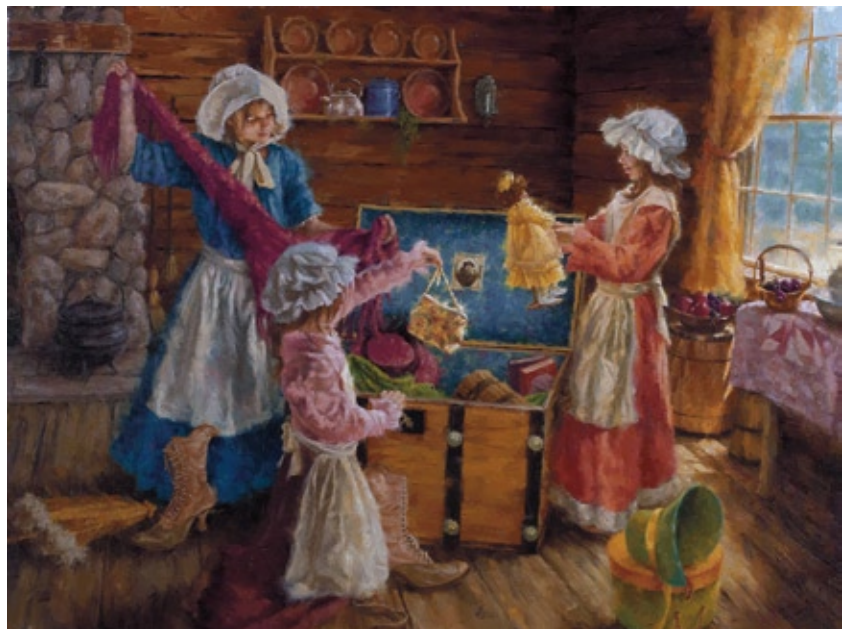
Aunt May's Travel Trunk , oil, 36 x 48"