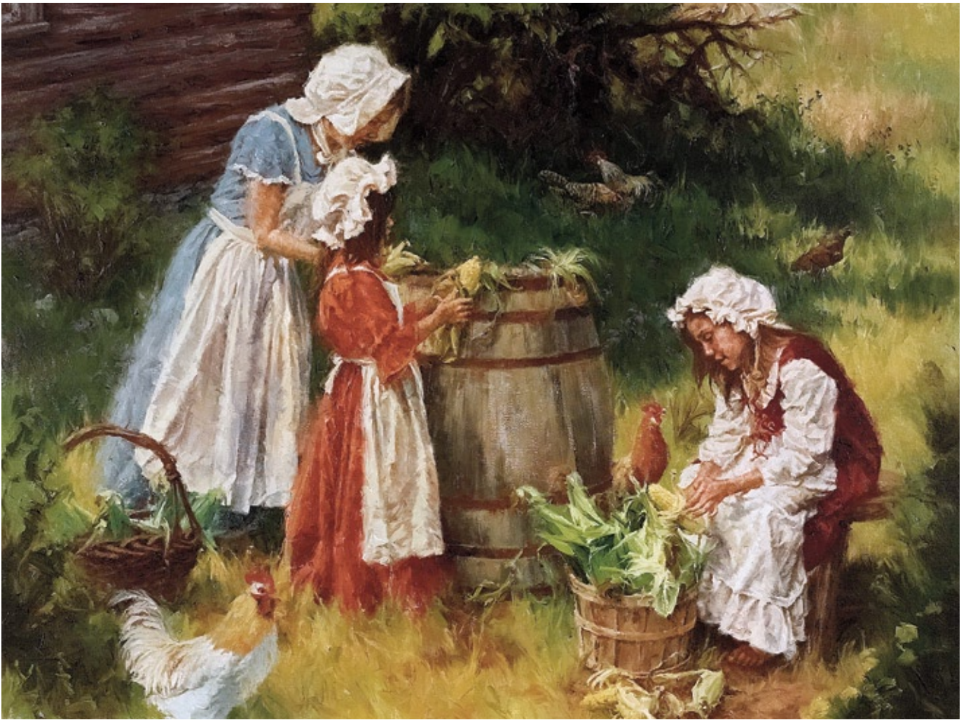
Sweet Supper Tonight , oil, 30 x 40"